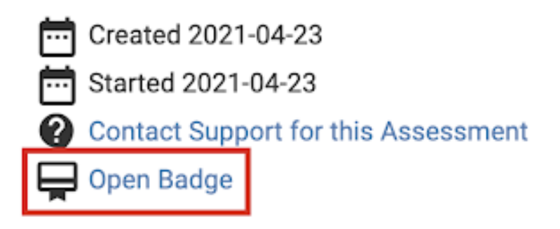
Figure 9: TrueAbility - Badge